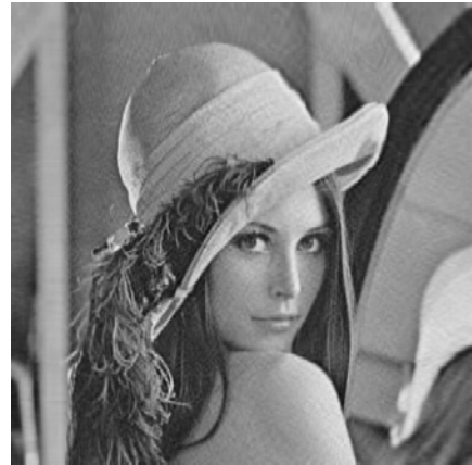
Figure 5: Image from A_{70} .

In figure 6 the plot of the transmitted energy against k obtained from equation (6) is shown. The plot of the relative difference against k derived from equation (8) is also presented, in figure 7, as an example of the applicability of the expressions described above. Notice, for example, that with an approximation of rank one, more than the 90% of the