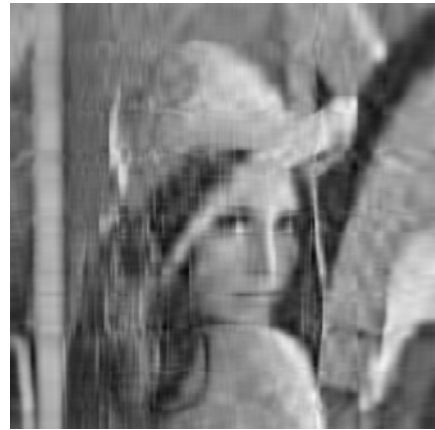
Figure 4: Image from A_{15} .