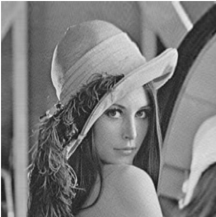
Figure 2: Image from A_{80} .