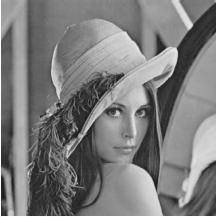
Figure 1: Image from matrix A .

Using MATLAB to evaluate the SVD, the singular spectrum of the matrix A can be calculated. We obtain r = \text{rank}(A) = 507 , and k \geq 80 to fulfill equation (13). Then, to obtain a relative difference less or equal to 0.040 we may use A_{80} as a compressed version of A . The image obtained from A_{80} is shown in figure 2. Using u_i and \sigma_i v_i^T , i = 1, \dots, 80 , to transmit A_{80} , a compression ratio of 3:1 is achieved. In figures 3, 4 and 5 we show images from A_{10} , A_{15} and A_{70} .