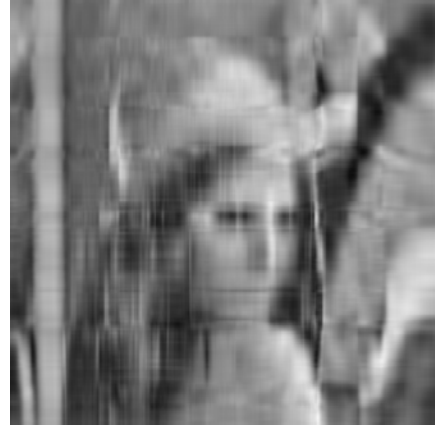
Figure 3: Image from A_{10} .